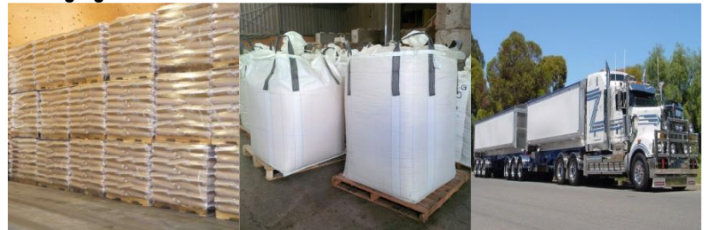
25kg woven poly bags